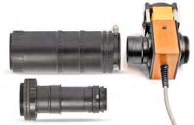
M68 Tele-Compendium with TZ-system and heated Solar Spectrum H-alpha filter