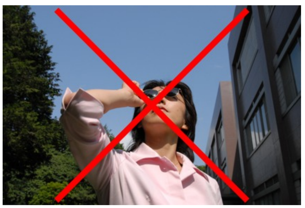
It is very dangerous to look at the Sun directly even with sunglasses

Do not look at the Sun with standard telescopes or binoculars.