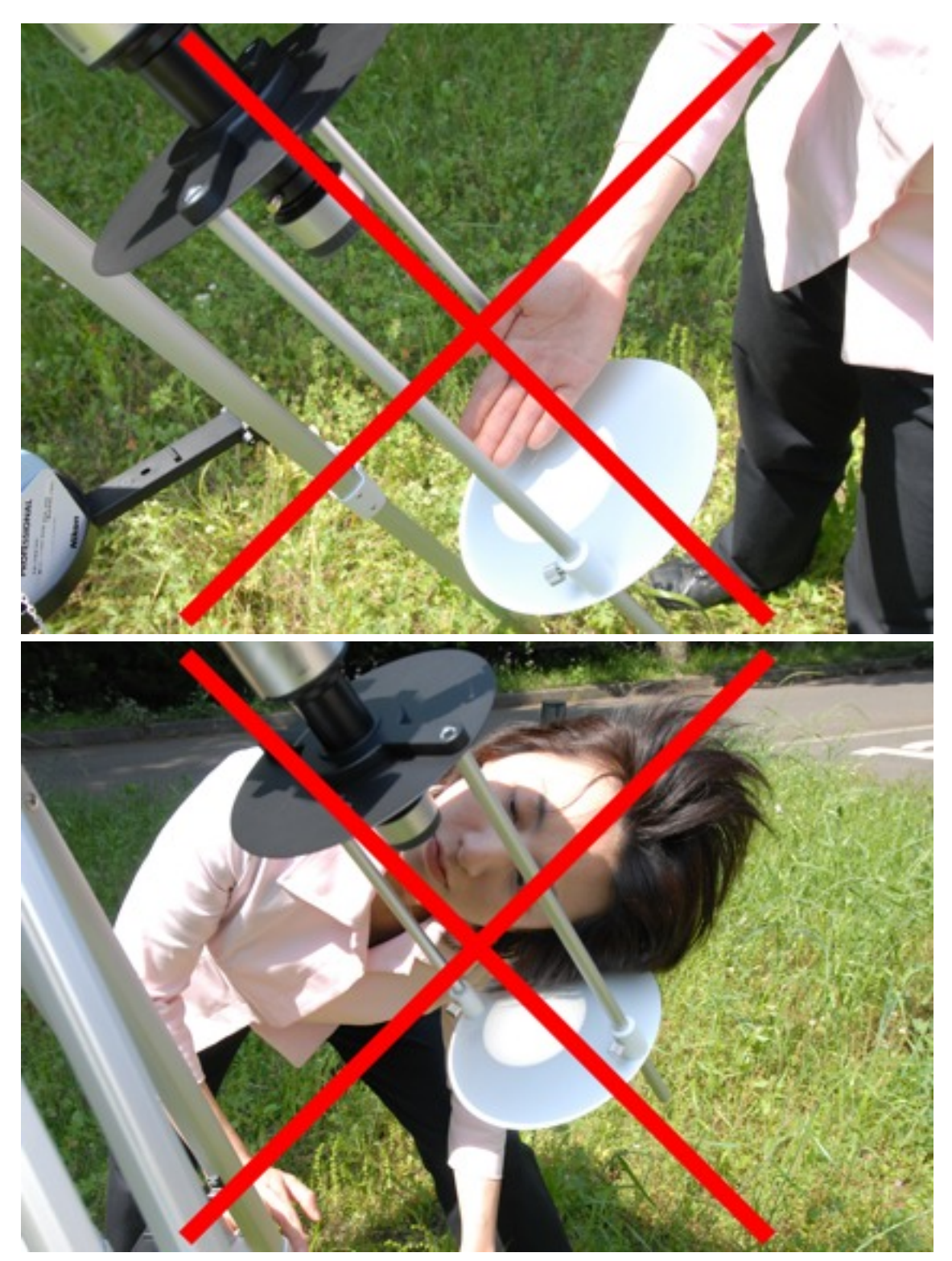
It is very dangerous to insert body parts into or to look through the path of light.

If you conduct solar viewing over a long period, the telescope or its accessories may become damaged due to heat. If you find any abnormalities to the telescope or its accessories, stop the viewing immediately.