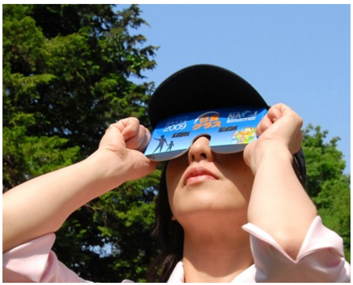
Example of how to use specially designed solar filter

To view a solar eclipse, you need a specially designed solar filter, such as the one used in eclipse glasses. The following explains how to use a filter and gives examples of products.