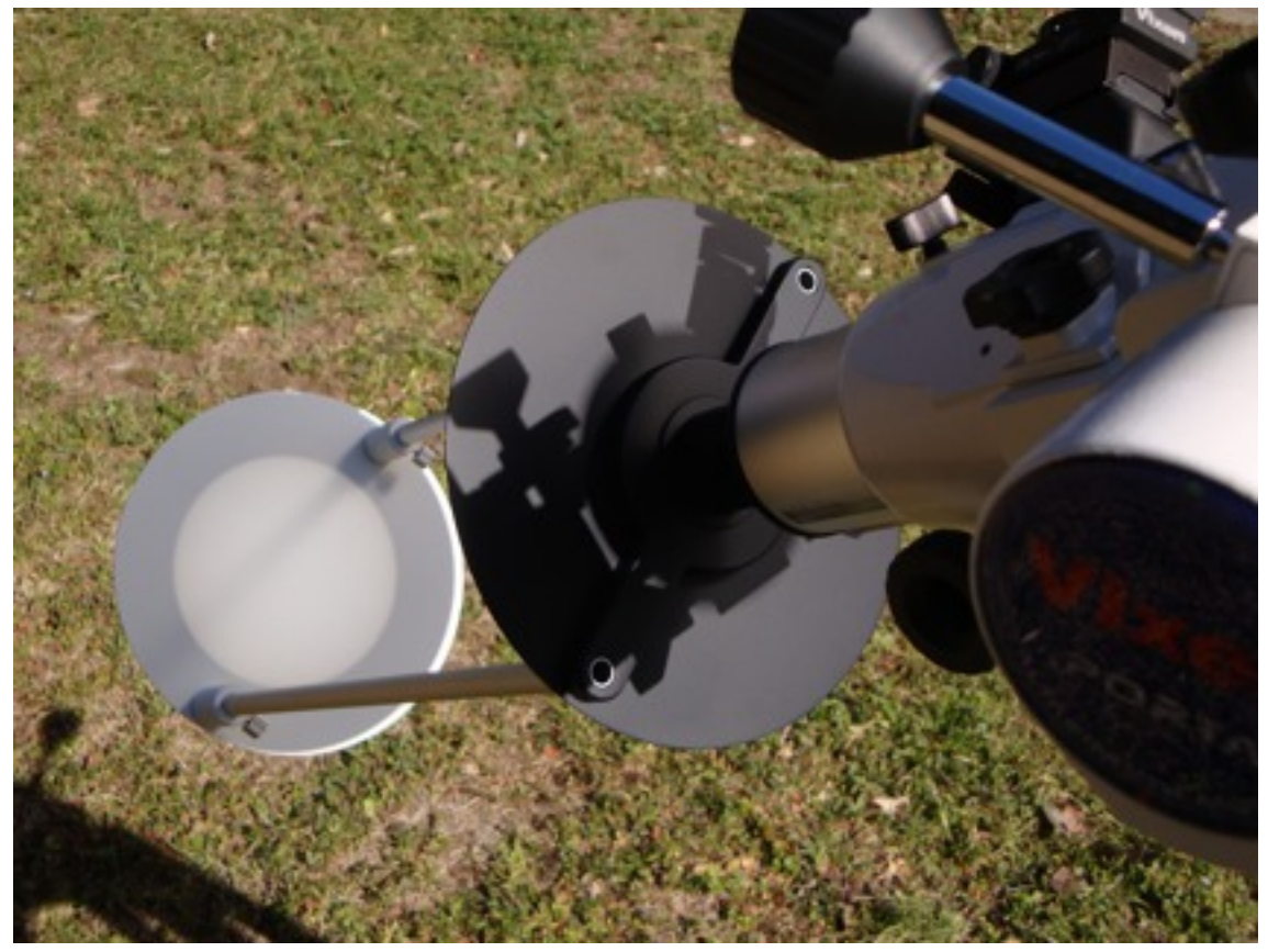
Example of a Solar Projection Screen in use (The model in the photo is Vixen's "Solar Observation Set 2009")

A Solar Projection Screen must be installed near the eyepiece correctly with the weight balance of the telescope adjusted.