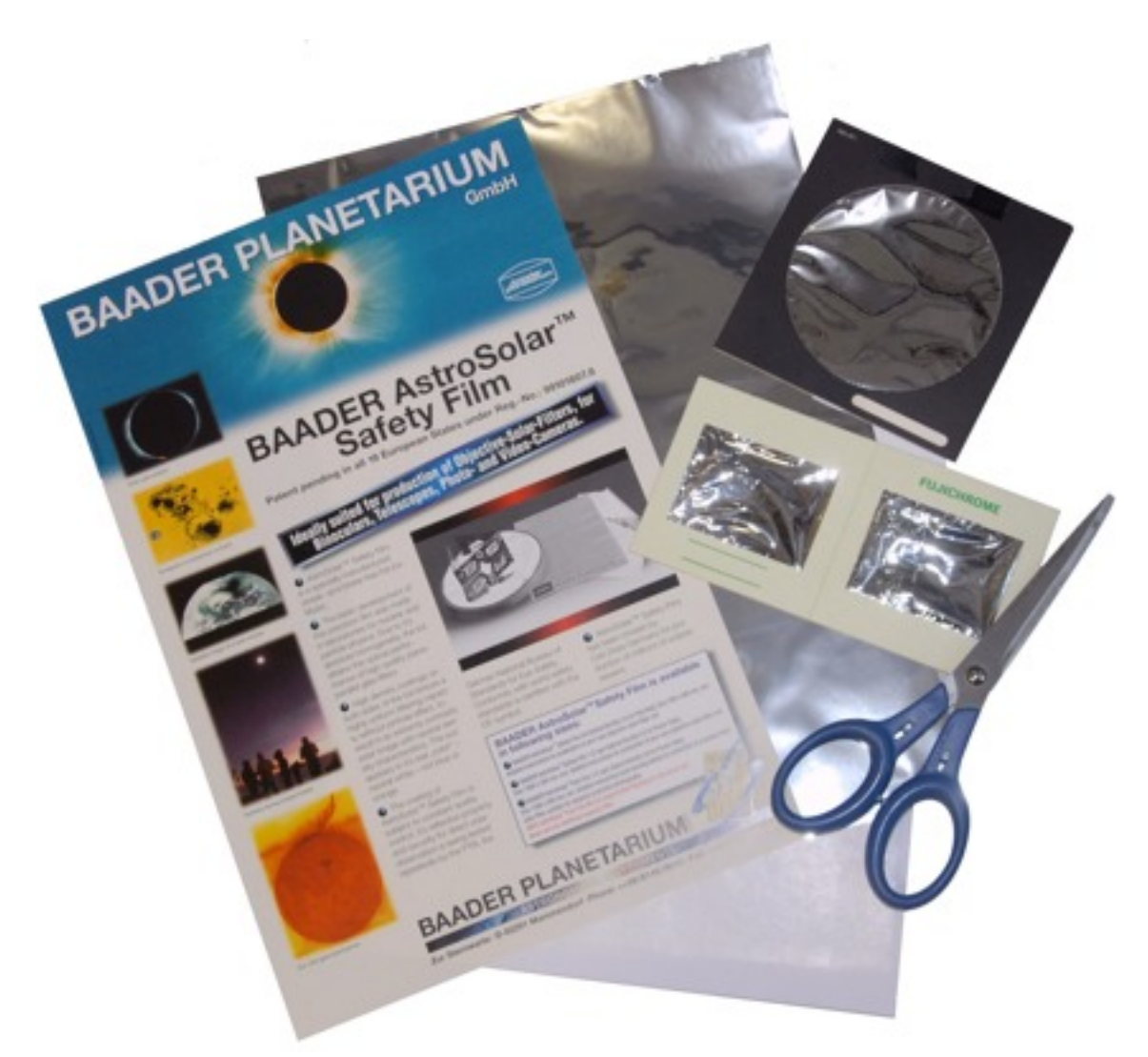
Baader Planetarium's AstroSolar™ Safety Film

Thin sheet-type shields, such as Baader Planetarium's AstroSolar<sup>™</sup> Safety Film, are now available on the market. They can be cut to various sizes to be placed in filter rims or slide mounts. When hand-crafting a solar filter using this product, please assemble it carefully to prevent accidental exposure to direct sunlight.