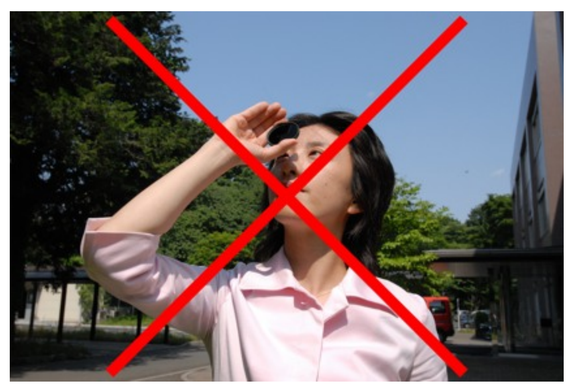
Do not look at the Sun through neutral density (ND) filters for photography.