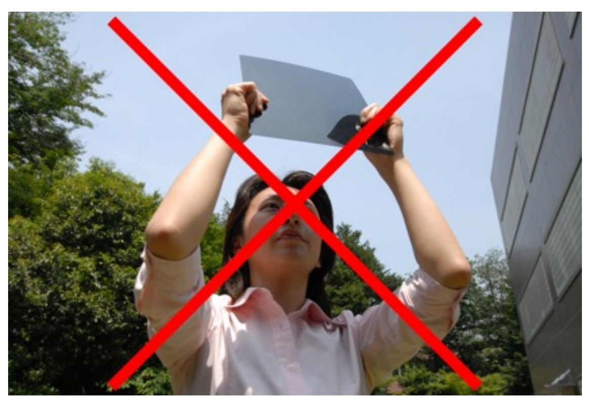
Do not look at the Sun through black or colored plastic boards.