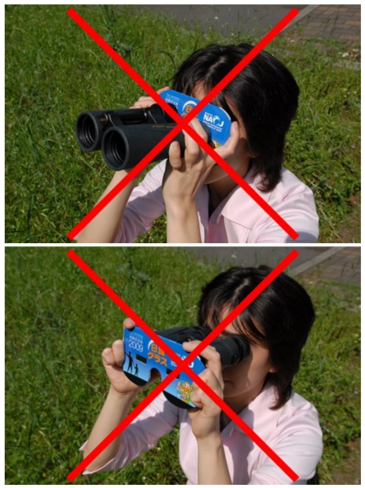
Do not combine solar filters designed to be used with the naked eye with binoculars, telescopes or cameras.