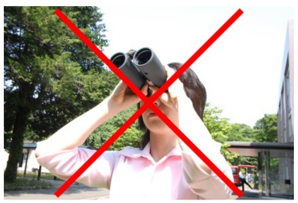
You must no look at the Sun directly with standard telescope or binoculars.