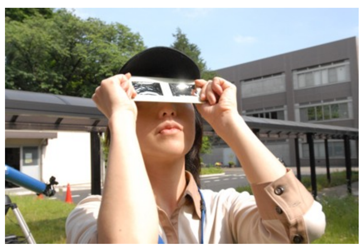
Example of a handmade solar filter (shield placed in a paper slide mount)

Please make sure that there are no gaps, holes or damage to the filter that would expose your eye to direct sunlight.